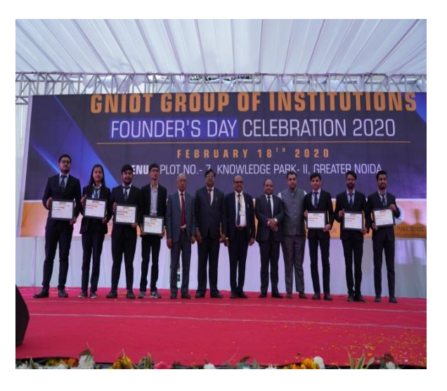
Award Category: Cultural Achievement