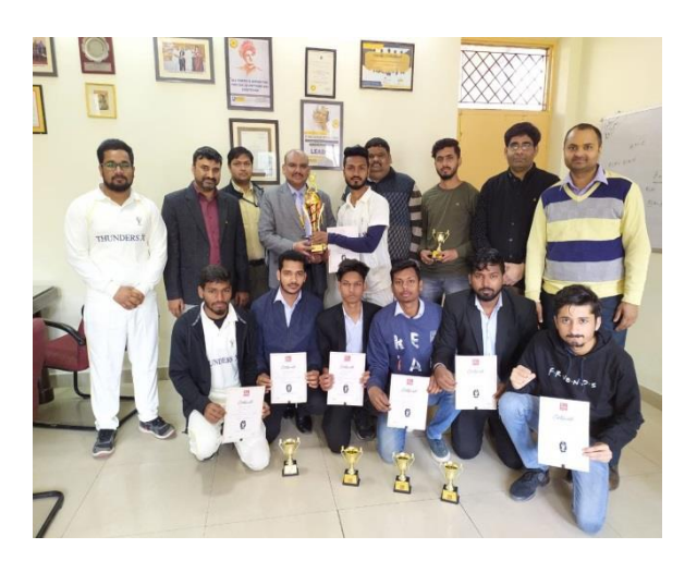
The Cricket team included the following players:

GNIOT Cricket Team won the first prize in Cricket Tournament organized by KCC Institute of Technology, Greater Noida during 11-12 February, 2020.