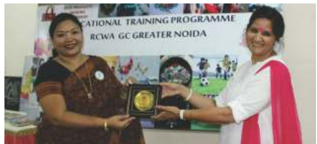
DIRECTOR-MBA INSTITUTE RECEIVING MEMENTO BY PRESIDENT OF RWA-CRPF, GR. NOIDA