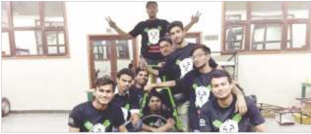
STUDENTS WITH THE MACHINE