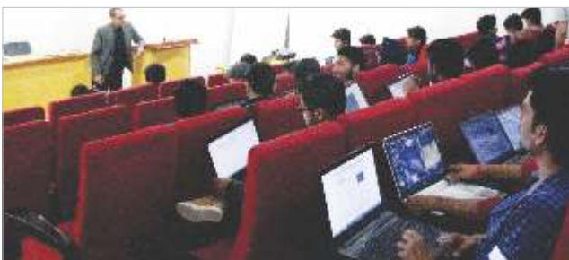
STUDENTS AT PYTHON WORKSHOP