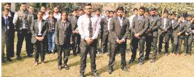
CELEBRATING 10 th MANAGEMENT DAY

The GNIOT MBA Institute celebrated 10 th National Management Day. The occasion was lead by Director - MBA Institute and the Head of the Department - MBA Institute. All the management courses students- MBA, MAM, and PGDM actively participated in the celebration. The interactive session also included the realization of Swachh Bharat. The session was indeed a "learn while fun" session thoroughly enjoyed by the students.