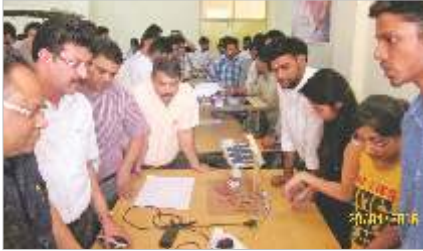
STUDENTS EXPLAINING THEIR PROJECT