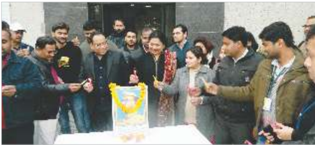
VICE CHAIRMAN ALONG WITH FACULTY MEMBERS AND STUDENTS PAYING TRIBUTE TO MARTYR