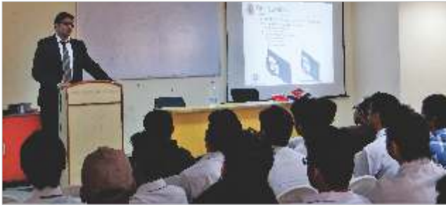
SPEAKER GIVING THE PRESENTATION