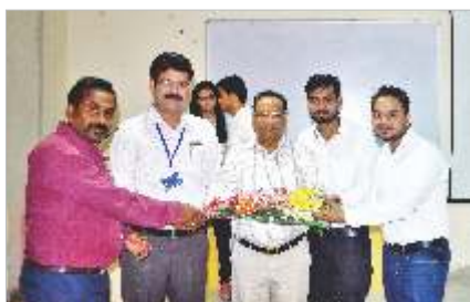
TEACHER IN-CHARGE & STUDENT COORDINATORS WELCOMING VICE CHAIRMAN & DIRECTOR-ENGG. INST.