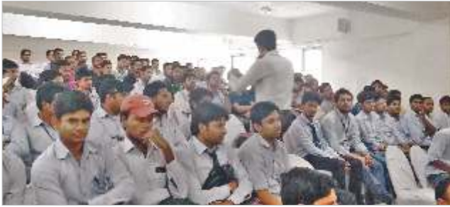
STUDENTS DURING INDUSTRIAL AUTOMATION SEMINAR

The Department of Electrical Engineering organized a seminar on the latest topics on Industrial Automation for the students of all the three years. It was presented by Expert InGLOBE Pvt. Ltd. under the guidance of HOD-EE. This seminar was very informative and interactive for the students and helped them in thinking of building their career in Industrial Automation.