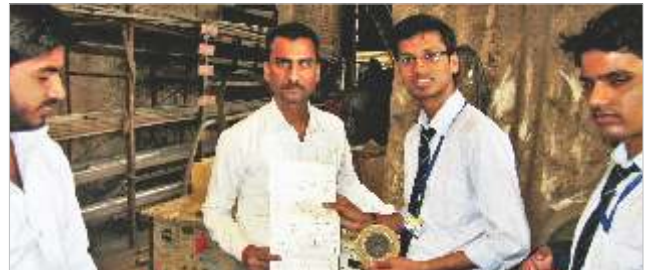
STUDENTS VISITING THE PLANT

The Department of Mechanical Engineering organized an industrial visit to the production plant of Super Cryogenic Systems Pvt. Ltd. in NOIDA. The plant was set up for the fabrication of pressure vessels and containers capable of storing and carrying fluids at very low temperature. The students learned about various industrial grade materials, fabrication processes, third party concept, machines, plant layout, material handling and some management and quality control methods.