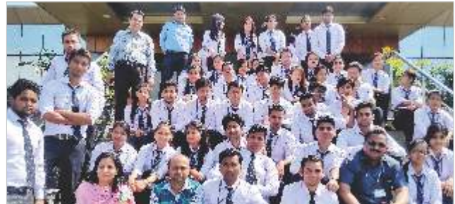
STUDENT'S VISIT TO ANMOL BAKERS