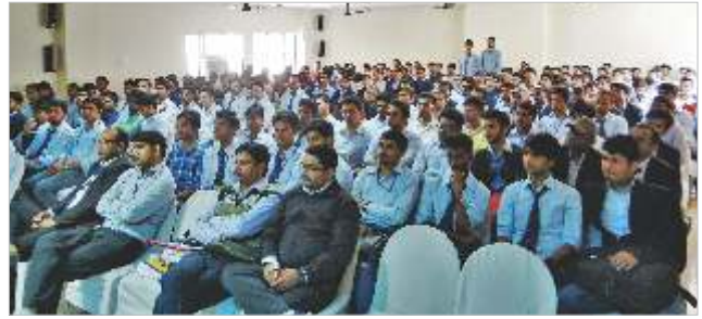
FACULTY AND STUDENTS AT THE SEMINAR

The Department of Mechanical Engineering organized a seminar on designing software's, AutoCAD and Solid Works. A team of experts was invited from Le Logics, a well-established company dealing with educating students about various industrial application softwares, to conduct a seminar on the same for B.Tech Mechanical Engineering third year students. The seminar was purely practical and application based so along with gaining a very fruitful industry standard concepts and applications, the students also had an hour of fun.