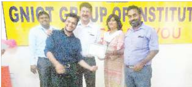
CERTIFICATE DISTRIBUTION AT INVESTITURE CEREMONY