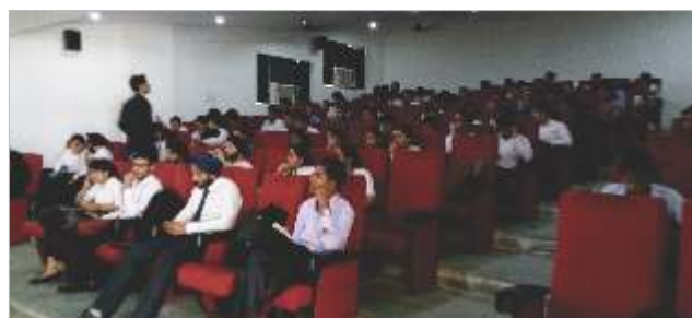
STUDENTS DURING PLACEMENT DRIVE