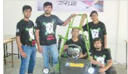
"FUTURE-GREEN CAR" TEAM

The GNIOT TechClub organized Projex – an exhibition of Major Projects of final Year students of all branches. Almost 30 teams comprising 200 members participated in the event. Few of the eco friendly projects like "Future green car", "Solar tracking system", "Solar vehicle", etc. were the main attraction. Some future concepts like "Pedal wheel charger", "Footstep electricity generation", "Touchscreen control smart wheel chair", "LPG Refrigerator", "Pedal power hacksaw", etc were also demonstrated. The best in computer applications section were "INDOHAAT.com", "Home automation and security system", "Offline aptitude portal", "Text summariser", "Hotel ordering system", etc. Participation certificates to all and medals to the winners were distributed by the Chairman.