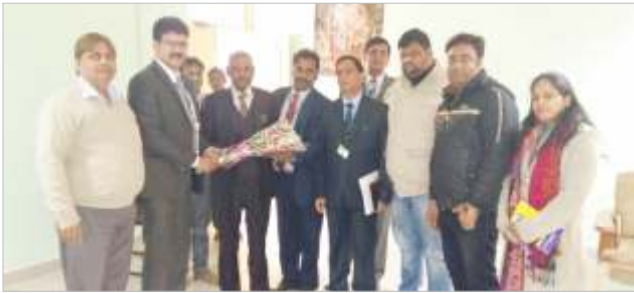
DIRECTOR-ENGG. INST. ALONG WITH ALL THE HODs GREETING CHAIRMAN ON NEW YEAR