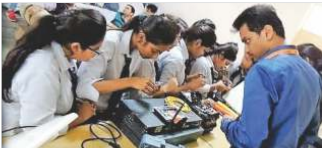
STUDENTS DURING OPTICAL FIBER WORKSHOP

The Department of Electronics and Communication Engineering organized a workshop on Optical Fiber communication and Data Networking and its applications, which was conducted by Milestone Achievers for the 2nd year students. In workshop, they guided the students on how to join fiber optic cable and how to prepare various types of network cables with connectors.