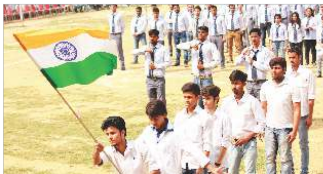
MARCH PAST BY THE STUDENTS