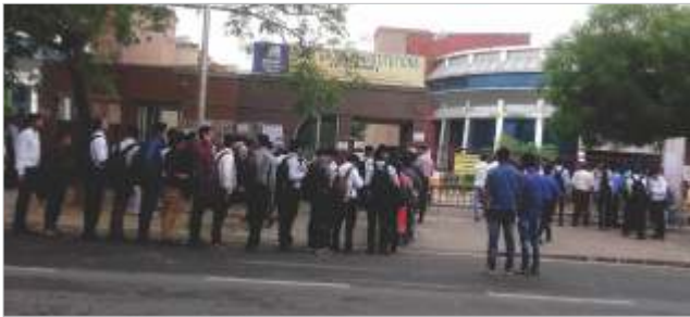
STUDENTS AT JOB FAIR