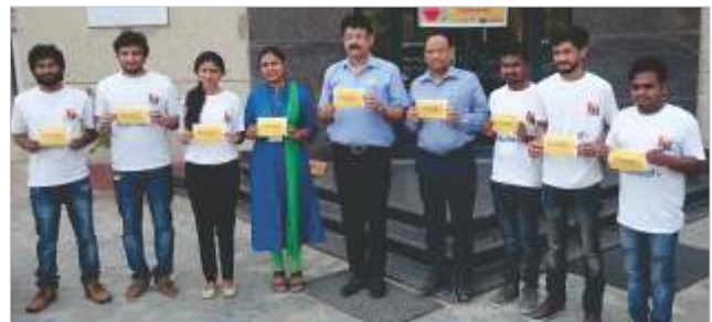
THE "INDOHAAT" TEAM