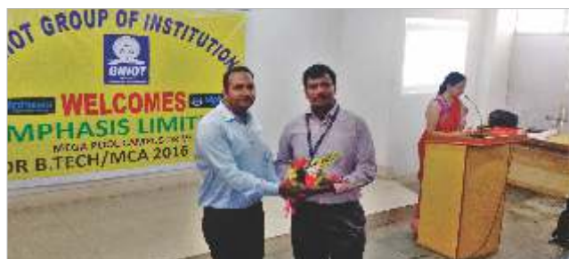
TPO INCHARGE WELCOMING REPRESENTATIVES FROM MPHASIS

The campus placements for the session 2015-16 have been outstanding. More than 250 students across all branches have been placed in various companies. The average salary package being offered in the current session was 3.5LPA. The major recruiters were IBM, United Health Care, Wipro Technologies, Tata Consultancy Services, Capgemini, HCL Technologies, Mphasis, Sapient Technologies, to name a few.