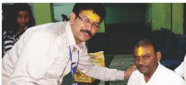
DIRECTOR-ENGG. INST. WITH CHAIRMAN AT HOLI MILAN

The festival of colors is celebrated with lot of joy and enthusiasm every year in our college. In continuation of this tradition, this year also this festival was celebrated with equal zeal. Chairman put chandan tilak on everyone's forehead and conveyed his best wishes to all the students and faculty members.