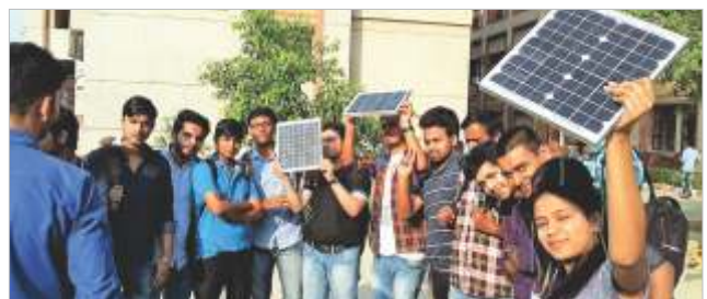
STUDENTS AT SEMINAR ON SOLAR CELL ENERGY

The Department of Electrical Engineering organized a seminar on latest topics on Solar Cell Energy. It was presented by Prime Vision Automation Solution Pvt. Ltd. This seminar was very informative and interactive for the students and will help them in building up their career in Industrial Automation. Around 150 students of 2 nd year, 3 rd year and 4 th year participated in the event.