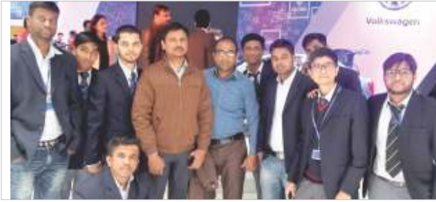
STUDENTS AND FACULTY AT AUTO EXPO

The Department of Mechanical Engineering organized a visit to Auto Expo Mart. VOLKSWAGEN invited the students to attend the presentation on electric car (E-Car), which elaborated on the basic advantages of an electric car such as and not limiting to no pollution, noise free drive, low driving cost and much more. After the presentation students explored and enjoyed rest of the halls displaying various new and upcoming vehicles, exciting concept cars and some well known vintage cars.