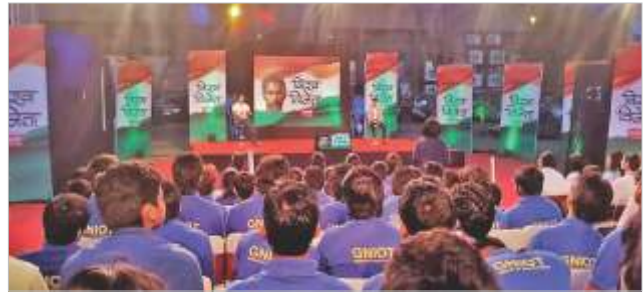
STUDENTS AT THE SHOW "VISHWA VIJETA"

ABP News organized a live show named "Vishwa Vijeta" in which the students of B.TECH, MBA & MAM of GNIOT Group of Institutions participated. The chief guests of the show were Mr. Shoeb Akhtar and Mr. Gautam Gambhir from the Cricket Fraternity. The show was telecasted live from 13 th - 15 th March, 2016 on the day of the T-20 match between India and New Zealand. There was a mutual discussion between the two presented guests at the forum and the interactive session between the guests and the students were held.