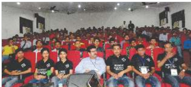
STUDENTS AT THE WORKSHOP