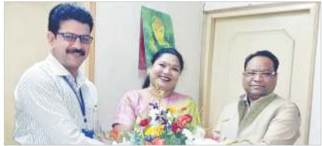
DIRECTOR-ENGG. INST. ALONG WITH DIRECTOR- MBA INSTITUTE GREETING VICE-CHAIRMAN ON NEW YEAR