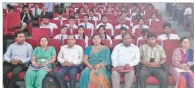
DIRECTOR-MBA INSTITUTE ALONG WITH FACULTY & STUDENTS AT THE WORKSHOP