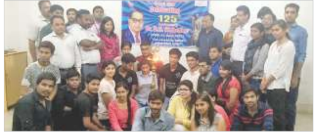
AMBEDKAR JAYANTI CELEBRATIONS