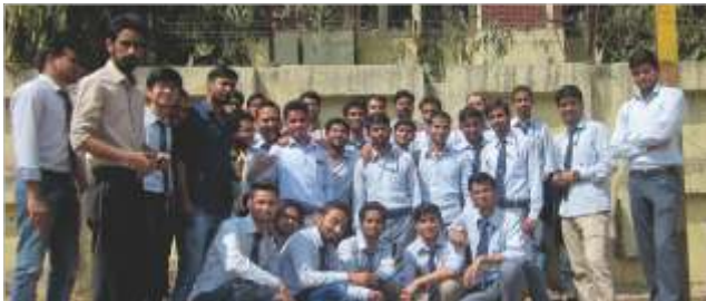
STUDENTS AT SUPER CRYOGENIC SYSTEMS