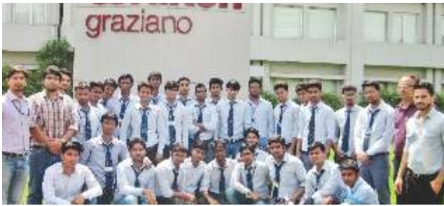
STUDENTS AT OERLIKON GRAZIANO