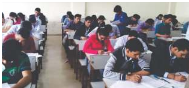
STUDENTS GIVING NCAT-2016

The Department of Electronics and Communication Engineering conducted the 5 th National Creative Aptitude Test (NCAT-2016). It is a creative aptitude exam which is conducted at national level for all Graduates and Post Graduates candidates of all courses and branches. Approximately 250 students participated in this test.