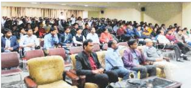
STUDENTS ATTENDING MOBILE APP WORKSHOP

The TechClub in association with CSE, IT and ECE department organized a workshop on Hybrid Mobile Application Development conducted by IBM. A total of 210 students attended the workshop in which the trainers awarded the IBM merchandise like T-shirts and Pens to the students. The trainers gave the demo of hybrid mobile application development and they also conducted a general aptitude test for the students and students scoring above 75% marks were provided 4-6 weeks training by IBM on Mobile App.