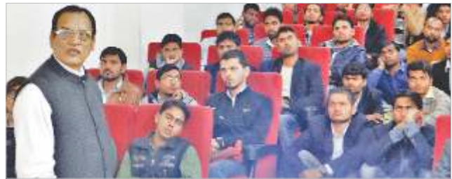
STUDENTS LISTENING TO THE TALK BY THE SPEAKER