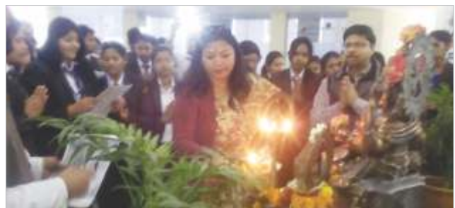
DIRECTOR-MBA INSTITUTE ALONG WITH STUDENTS

The GNIOT MBA Institute celebrated Basant Panchami at the campus. The celebrations started with Saraswati Pujan. The Director-MBA Institute, presided over the proceedings and made offerings to the Goddess along with the faculty members and students. Various Management games were organized during this occasion in which the students participated with full zeal and enthusiasm. The occasion was celebrated with the view to remove the ignorance and to enlighten the path with wisdom.