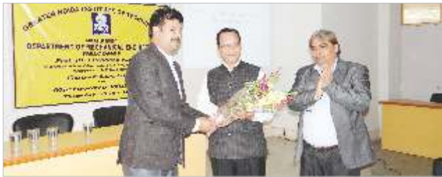
WELCOME OF THE SPEAKER BY DIRECTOR-ENGG. INST. & HOD-ME