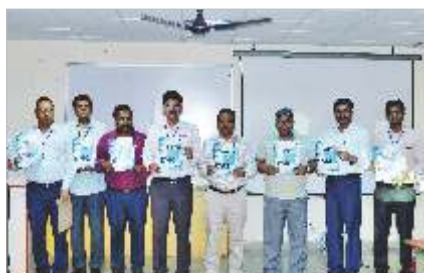
INAUGURATION OF "INK"