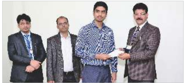
DIRECTOR-ENGG. INST. DISTRIBUTING OFFER LETTER TO SELECTED STUDENTS

The GNIOT Group of Institutes organized two Mega Job Fairs. The first one was held on 19 th – 21 st February, 2016, for graduates and polytechnic diploma students. The second fair was held on 5th May, 2016 for engineering graduates. Both the job fairs saw an encouraging response from students from Delhi and NCR. Companies representing various branches of engineering were invited for the job fair. There were three rounds – online aptitude test, technical interview and HR round. The selected students were given their offer letter.