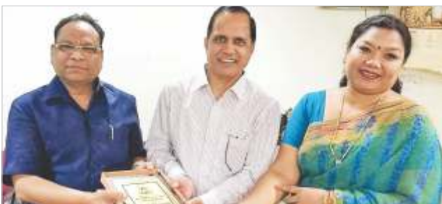
VICE-CHAIRMAN ALONG WITH DIRECTOR –MBA INSTITUTE PRESENTING MEMENTO TO SPEAKER