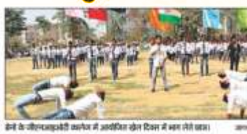
छात्रों के जीएनआईओटी कॉलेज में आयोजित खेल प्रतियोगिताओं में भाग लेते छात्र।