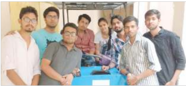
ME FINAL YEAR STUDENTS WITH SOLAR CAR

The final year students of Department of Mechanical Engineering built a car that runs with the help of solar energy. This is a zero emission vehicle with a load carrying capacity of 250-300 kg and runs with the help of a 900W motor. The time needed for the first full charging is 10 hours and a run time of 4 to 5 hours is delivered at a running speed of 35 kilometers per hour.