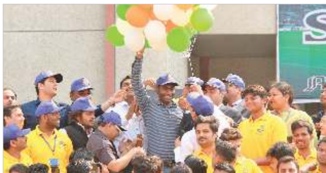
RELEASING OF THE BALLOONS