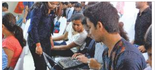
STUDENTS DURING ETHICAL HACKING WORKSHOP

The GNIOT Cultural Club organized a two days workshop on "Ethical Hacking & Cyber-Security" conducted by experts from i3indya Technologies. In this workshop students were given exposure to Ethical Hacking, the latest tools and methods being used by cyber criminals & terrorists and how Ethical Hackers can fight them.