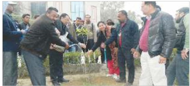
VICE CHAIRMAN ALONG WITH FACULTY MEMBERS AND STUDENTS AT TREE PLANTATION

The TechClub and GNIOT Cares came together to salute the martyrdom of soldiers who lost their lives defending the sovereignty of the Nation. All the teachers and students paid homage by observing two minutes of silence and lighting the candles and every individual took a pledge that they will remain committed towards cleanliness. On this event Vice-Chairman and Director-MBA Institute, along with all the faculty members planted over 120 trees in the college campus.