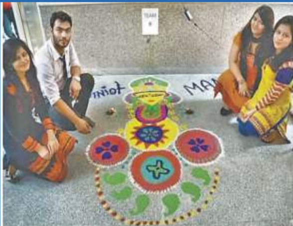
जीएनआईओटी कॉलेज में आयोजित कार्यक्रम में रंगोली बनाते स्टूडेंट्स।

कार्यशाला में 109 से अधिक छात्रों ने भाग लिया। इस कार्यक्रम का आयोजन कॉलेज के कानून कक्ष के छात्रों ने किया। छात्रों को साइबर सुरक्षा के विभिन्न पहलुओं पर बताया गया कि साइबर सुरक्षा के लिए साइबर सुरक्षा और कानून पर कार्यशाला का आयोजन किया गया।